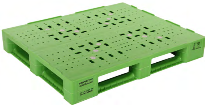
Upper Deck Anti slip Rims